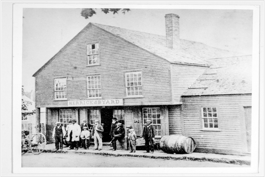
Herrick & Byard store, Sedgwick, c. 1880