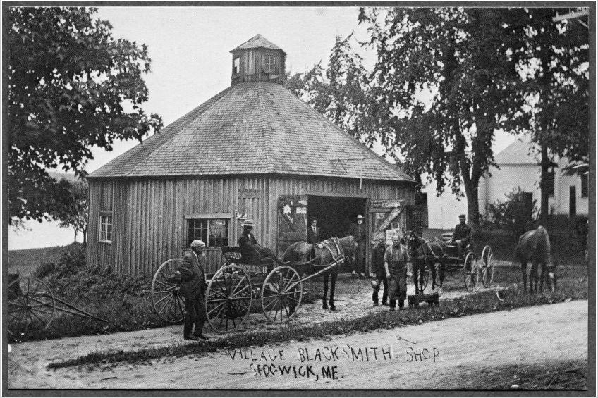
Village Blacksmith Shop, Sedgwick