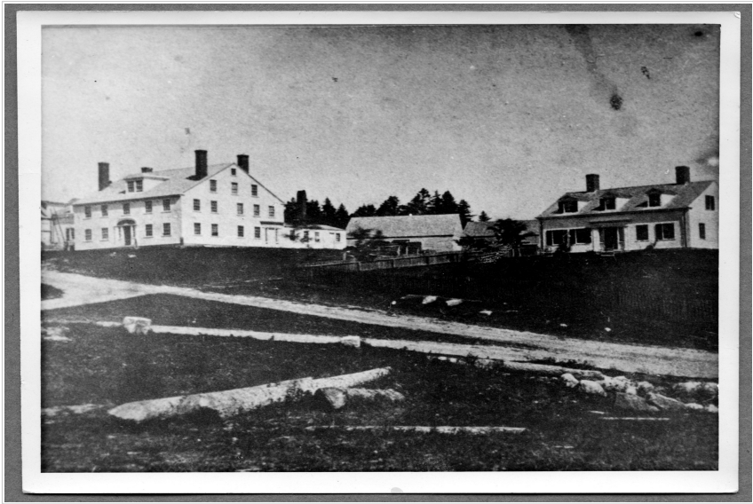
Houses along the road, Sedgwick