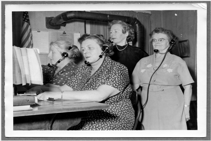
Switchboard operators at work, mid-20th century