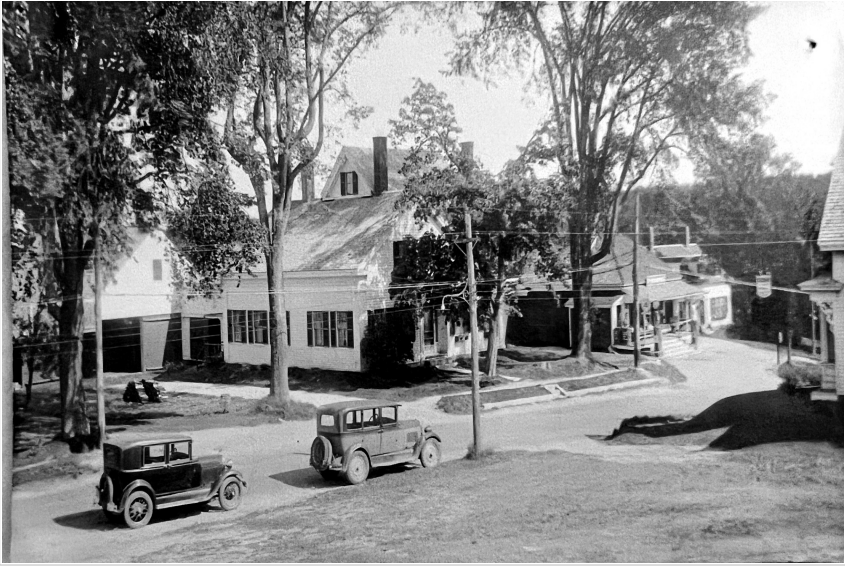
High Street, Sedgwick, 1930