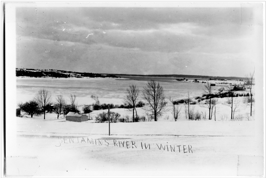
Benjamin's River in winter